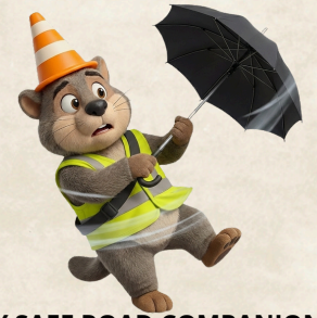
MY SAFE ROAD COMPANION